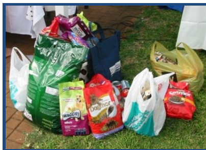
Some Food for Inanda Dog Project